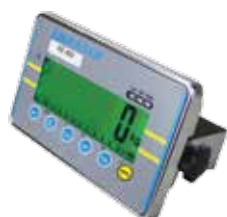
AE 402 Indicator